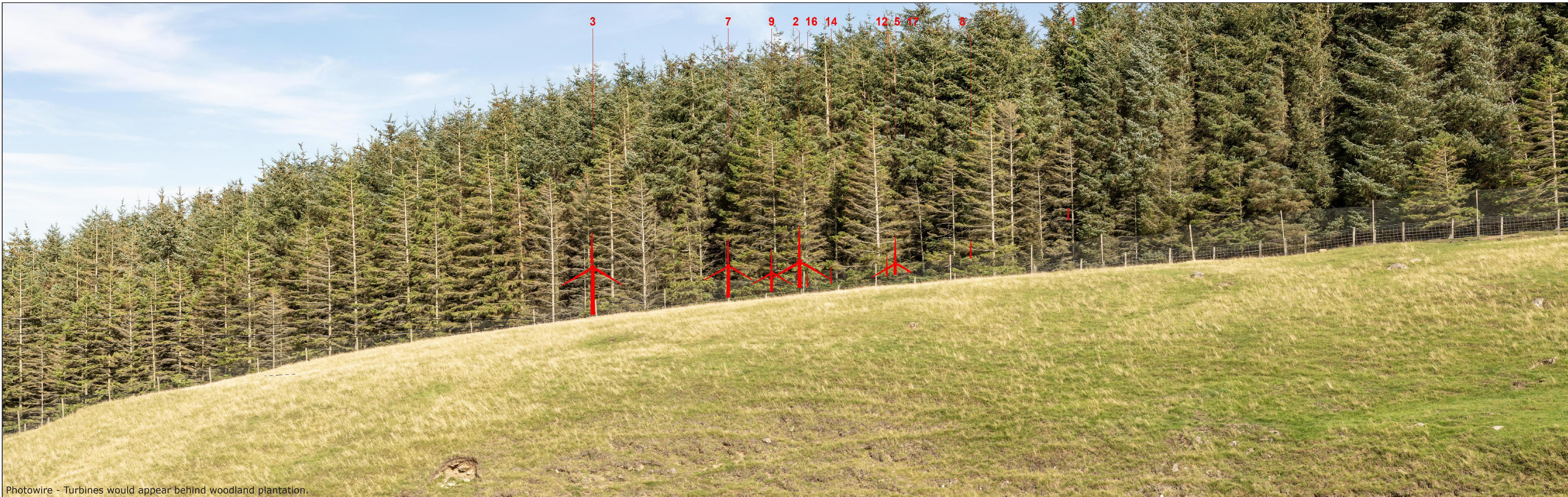
Photowire - Turbines would appear behind woodland plantation.

Viewpoint Information OS Reference: E329850 N651225 Distance to nearest turbine: 3038m (T1) Ground level: 333m (AOD) Bearing to centre of photograph: 45.9°